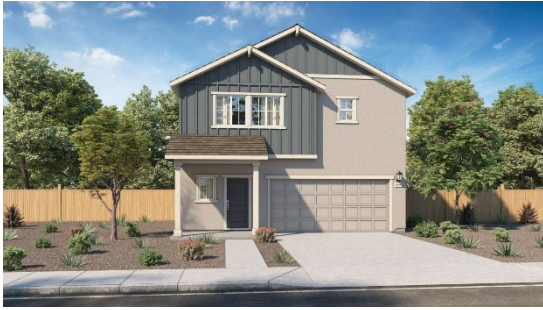
A - Farmhouse

886 PICO PLACE, CHICO, CA 95973 | DRHORTON.COM/SACRAMENTO