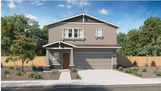
B - Craftsman