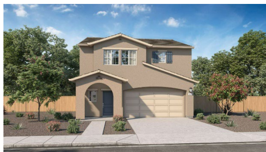
C - Mission